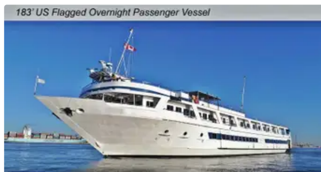
183' US Flagged Overnight Passenger Vessel